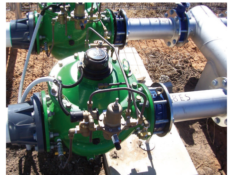
Bermad 900 series valves running to two farms.