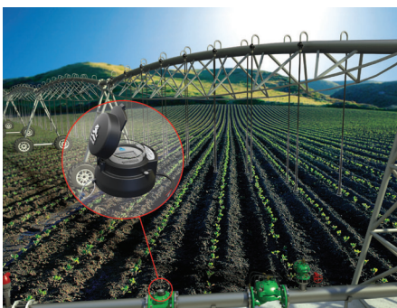
The Bermad TURBO-IR-BE flow meter designed for irrigation applications.

For many years, the Bermad TURBO-IR paddle design flow meter has proven itself as a robust product used and trusted by private and government irrigation companies throughout Australia.