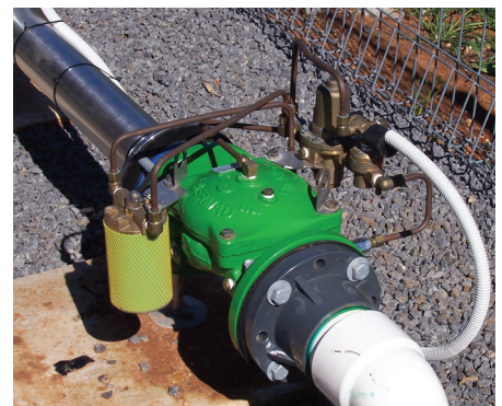
Bermad 400 series controlling flows to a smaller farm.

For further information or details on this Bermad application, please get in touch with our Victorian office.