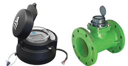
Newly redesigned Bermad TURBO-IR-BE flow meter.

Bermad's Electronic Register technology is an innovative solution with no moving parts – improving accuracy and sensitivity. This ensures increased metering reliability and high performance in your irrigation scheme.