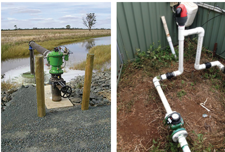
From left to right: Sensus WPD meter, 900 series Hydrometer, TURBO-IR meter with air valve.

To learn more about how to select the optimum irrigation meter visit: www.bermad.com.au/news-and-info/select-optimum-irrigation-meter/