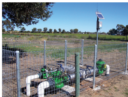
Property outlet with three Bermad 900 series valves supplying three independent farms.

The system has now been in operation for several years – still going strong. Providing ongoing water security to the Koraleigh community is just one of the many cases that highlight the Bermad quality standard. Our ability to work in large scale irrigation schemes highlights our commitment to forward-thinking water solutions.